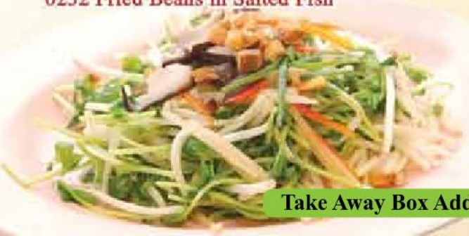
0232 Fried Beans in Salted Fish