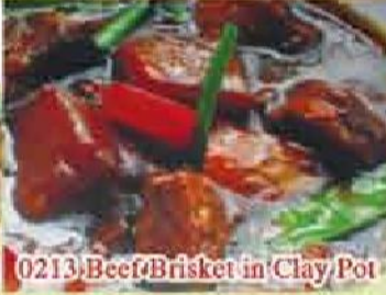
0213 Beef Brisket in Clay Pot