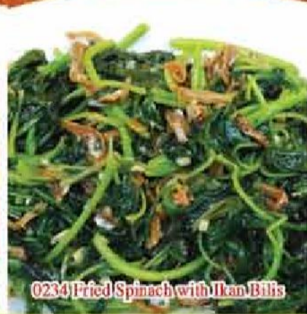
0234 Fried Spinach with Ikan Bilis