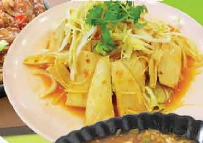
0211 Sliced Abalone with Thai Sauce Tofu