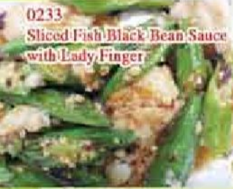
0233 Sliced Fish Black Bean Sauce with Lady Finger