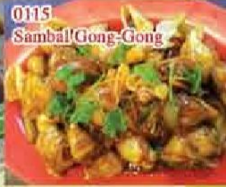
0115 Sambal Gong-Gong