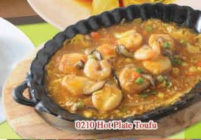
0210 Hot Plate Tofu