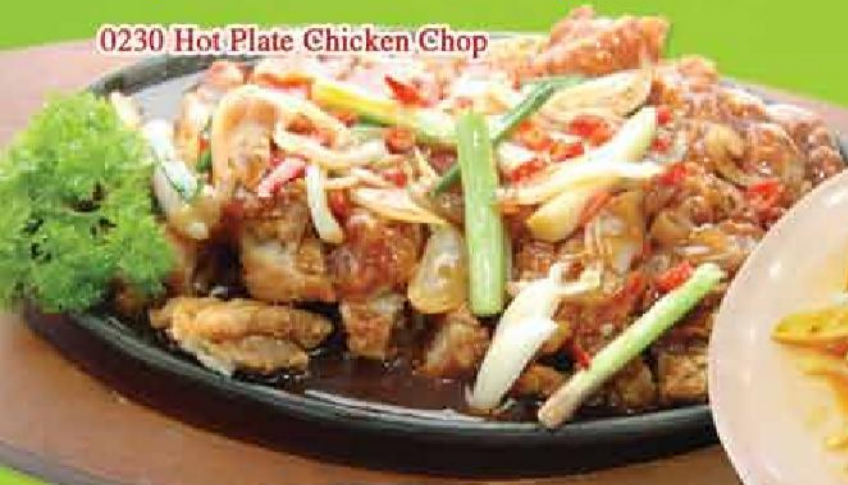
0230 Hot Plate Chicken Chop