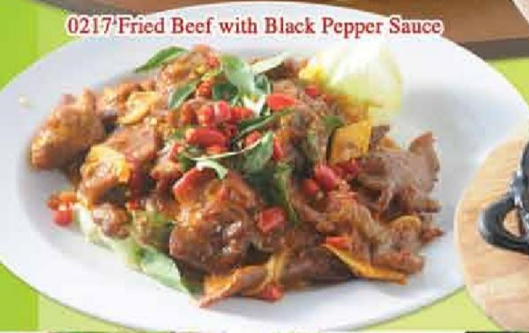
0217 Fried Beef with Black Pepper Sauce