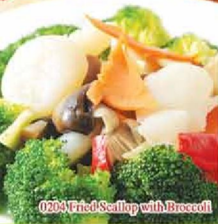
0204 Fried Scallop with Broccoli