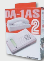
DA-1AS Single Tenant Box Set