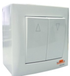
AVA-200 Spring-Loaded Mechanical Switch