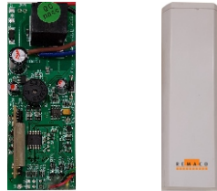
AVA-350A RF Receiver (For 24 Vdc Motor)