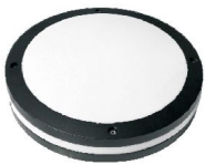
B3230C Circular Style