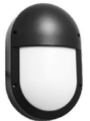
B3228V Verticle Ellipse Style