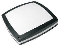
B3230S Square Style