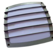
B3230G Square Grid Style