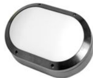
B3220E Ellipse Style