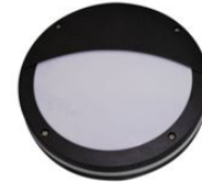
B3230H Semi-Circular Style