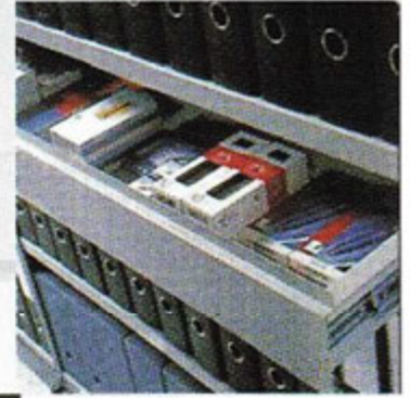
▲ Pull-out drawer for storage of stationery, small parts, CDs etc are available in different sizes and depth.

▶ Fixed dividers provide a simple but yet effective means of dividing any bay into many compartments.