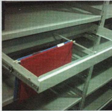
▲ Pull-out hanging frame for storing suspended files, etc