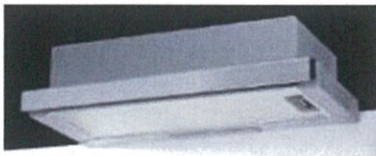
FOTILE UPA9001 TELESCOPIC HOOD EXTRACTION RATE: 450M3/HR SIZE: W898 X L460 X H190MM