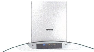
FOTILE EH-13 CHIMNEY HOOD EXTRACTION RATE: 1080M3/HR SIZE: W900 X L520 X H565-925MM