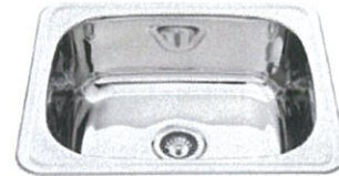
MONIC I-550 S/S SINK SIZE: W550 X L500 X D190MM